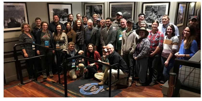
Ohio SAF Members at an informal Ohio Social during the SAF alumni receptions

If you served as a mentor this year thank you! Perhaps this will spark a reminder to re-connect with your mentor or mentee if you have not talked since convention. We hope that some of the mentor-to-mentee relationships will extend past the convention. Hopefully we can arrange a similar mentor match-up next year and continue to make improvements. Based on comments I heard from students and colleagues at the convention, I do not think many other states had a convention mentorship effort, but some were interested in trying it in their states. Don't forget, next year's SAF Convention – Oct. 28-Nov. 1, 2020. in Providence, RI.